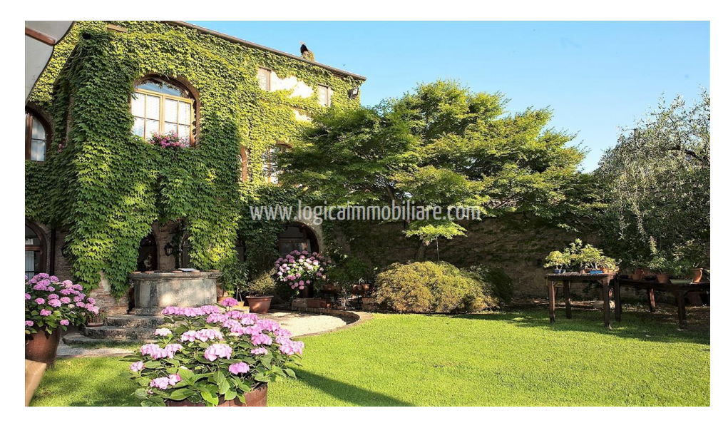
Size: 1600 sqm Rooms: 25 Bedrooms: 13 Bathrooms: 10 Energy class: G IPE: 175