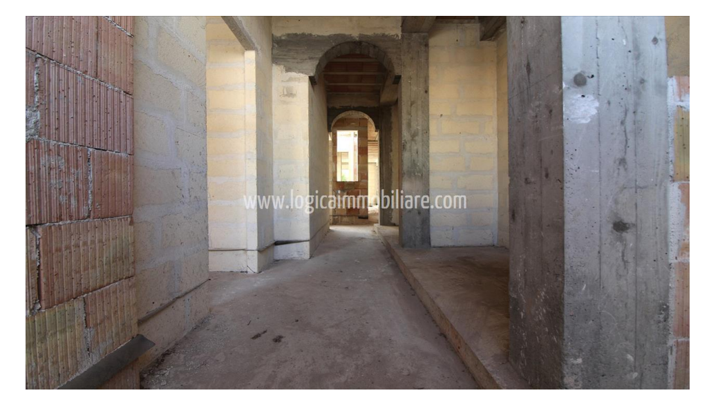
Size: 115 sqm Rooms: 5,5 Bedrooms: 2 Bathrooms: 2 Energy class: NA

In Soleto, a few steps from the main streets of the town, a recently built unfinished property with a surface area of about 115 square metres and a garden of 80 sqm. The property develops on the ground floor and consists of: entrance, hallway, kitchen, dining/living room, two bedrooms and two bathrooms. The living area is the most interesting part of the house, as it overlooks a delightful 80-square-metres rear garden, with a small patio. It is also suitable for the creation of a large open space, which would make the already very bright environment even more airy. A central cloister (light well) contributes to further enriching the property and its interior spaces. There is also the possibility of building a staircase to access the roof terrace, which is of exclusive property. Soleto is a small village in Grecia Salentina and borders with the city of Galatina. It is 22 km far from Lecce, 50 km from Brindisi airport, about 26 km from the splendid costs of Gallipoli and Santa Maria al Bagno.