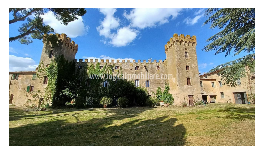
Size: 2700 sqm Rooms: 35 Bedrooms: 10 Bathrooms: 10 Energy class: G IPE: 175

Located in one of the most fascinating Tuscan hamlets at just few kilometres from Pienza, this prestigious property extends to approximately 27000sqm. It boasts a private 3000sqm garden that overlooks the stunning landscape of Val d'Orcia. The building is in a discrete state of maintenance, though it needs some restoration; the property is arranged over three floors of different heights, and it winds along a series of unified buildings that are characterized by two crenelated towers overlooking the whole property. The housing unit is arranged over the first floor and consists of about 20 rooms, besides ancillary rooms, for a total surface of approximately 1000 sqm. The first floor includes warehouses, cellars, storage rooms, that can be turned into residential buildings, as well as the second floor, that is characterized by high lofts with wooden beams and double-pitch roof. The property is complemented by another fascinating building, the old olive oil mill, characterized by spacious rooms and big arches. Thanks to its location, its wide surface and its charm, this dwelling is ideally suited for several purposes, though its features makes it an ideal place to create elegant tourist accommodation of high value. Siena is about 60 km away, Florence 120 km, Rome Fiumicino airport 210 km.