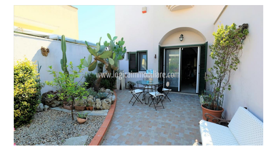
Size: 150 sqm Rooms: 8 Bedrooms: 3 Bathrooms: 3 Energy class: G IPE: 175

Set in the hearth of the village of Vitigliano, 5 km away from the clear waters of Santa Cesarea Terme, fascinating detached house of about 150 sqm arranged over three levels. A delightful and nice front yard with pergola leads to the house: the ground floor is composed by a large open space with livable kitchen, embellished with barrel and star-ceiling vaults and a double-sided fireplace, and a second living room with bathroom. A convenient staircase leads to the mezzanine floor where we find a master bedroom with en suite bathroom, and marvellous star vault ceiling, whereas the first floor houses two bedrooms, one with balcony and the other one with a solarium terrace tha overlooks the old town. The property was recently restored and is in excellent condition, with utilities and facilities up to standard, and is sold including furniture ; Vitigliano is a historical village, perfect to enjoy pristine water of the place without sacrificing a peaceful atmosphere and avoiding urban congestion during summertime. The house is 6 km away from Castro, 43 km from Lecce, 65 km from Gallipoli and 94 km from the airport of Brindisi.