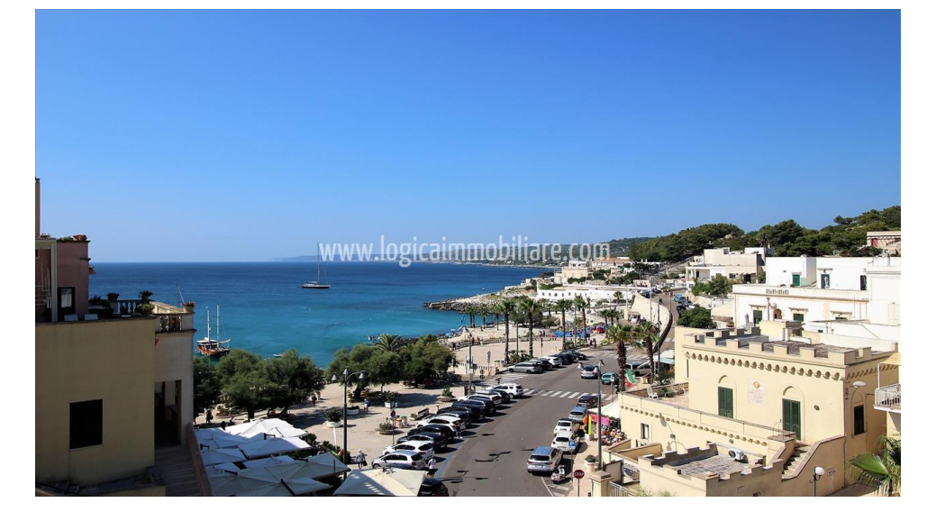
Size: 250 sqm Rooms: 7,5 Bedrooms: 3 Bathrooms: 1 Energy class: G IPE: 175