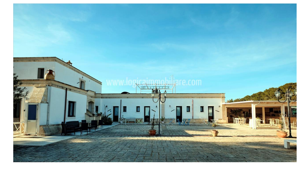
Size: 310 sqm Rooms: 15 Bedrooms: 9 Bathrooms: 9 Energy class: E IPE: 150