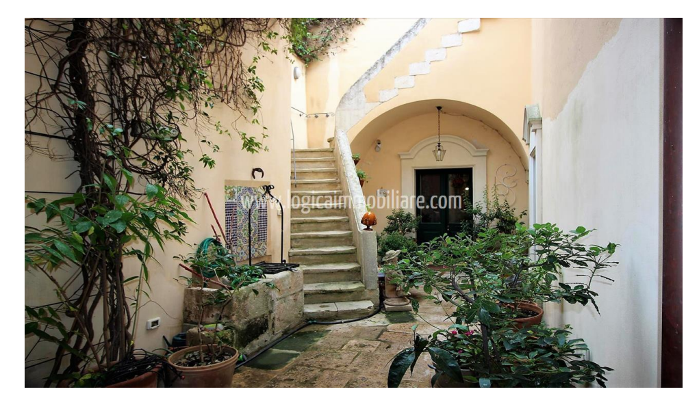
Size: 300 sqm Rooms: 15,5 Bedrooms: 4 Bathrooms: 3 Energy class: D IPE: 53,3