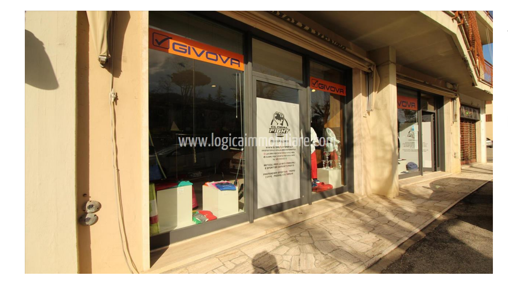
Size: 79 sqm Rooms: 3 Bathrooms: 1 Energy class: G IPE: 175

In the municipality of Montepulciano, Sant'Albino, in a well-served area and on the main road, shop currently leased for a total surface of 79sqm, located at the ground floor, including warehouse, cabin and toilets. The shop, completely renovated in 2013, can be used in the most various ways as it is large and bright, with two shatterproof and accident-proof windows that are clearly visible and signposted on the road that leads directly from Montepulciano to Chianciano Terme. The systems are all independent and regular, such as methane, water and the independent electrical system, and the property includes parking spaces and it is sold furnished. There is also a perfectly functioning alarm system. A proposal with a secure income, excellent as an investment.