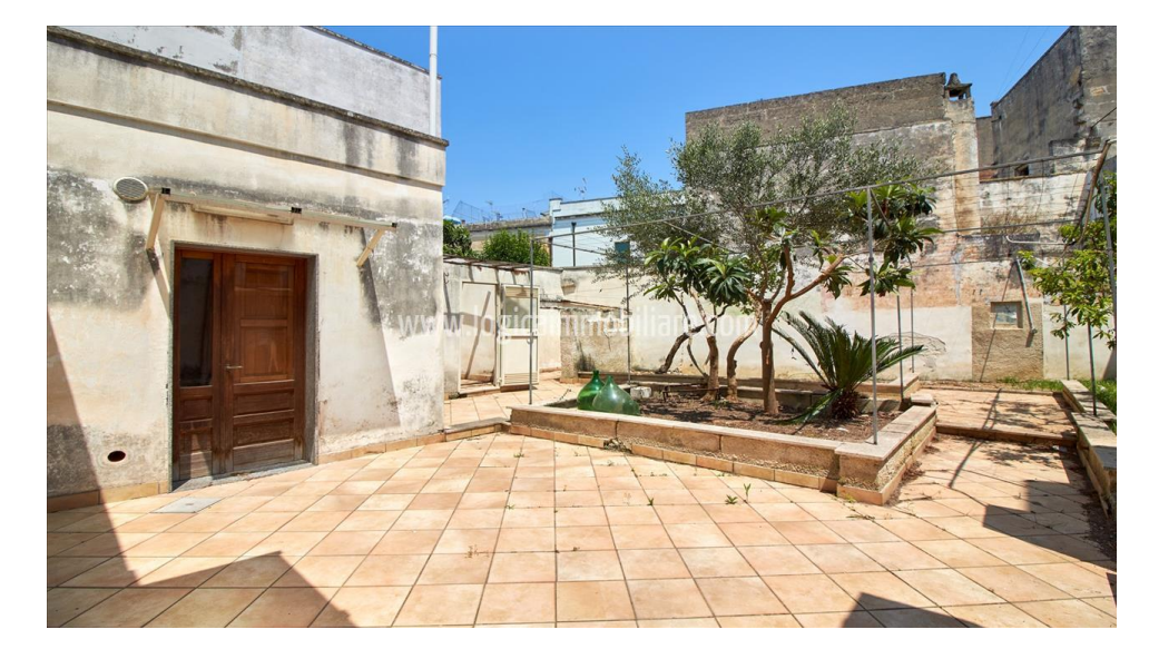
Size: 120 sqm Rooms: 5,5 Bedrooms: 1 Bathrooms: 1 Energy class: G IPE: 175

Located in a well-served residential area, semi-detached house of about 120 square metres with private garden and garage of 30 square metres in Monteroni, a little town a few kilometres far from Lecce. The house, that needs some renovation works, consists of a welcoming entrance/living room, a large dining room, kitchen, bedroom, a bathroom, and a closet. The property is enriched by a sunny veranda which gives access to a large rear garden, with an external shower, an ideal place for enjoying outdoor relaxing moments. There are many elements that recall the characteristic Salento house, like the old economic kitchen, which has been maintained as evidence of the daily life of the past, the traditional local star and barrel vaults, that allow the house to maintain an exceptional state of conservation. Perfect as a private residence, but also to be inserted in the tourist rental circuit, this fascinating property hides in its renovation an invaluable potential, researchable in the choice of materials and attention to details. Monteroni, located in a strategic position, is the ideal place to live all year round, a short distance from Lecce, about 3km, and from the sea, only about 15 km from the splendid beaches of Porto Cesareo.