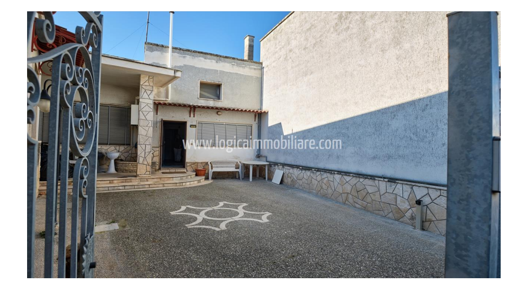
Size: 190 sqm Rooms: 8 Bedrooms: 2 Bathrooms: 2 Energy class: G IPE: 175

Located in a quiet and well-served position in Cavallino, just 5 minutes' drive from Lecce, independent house of approximately 190 sqm, with garden and veranda. The house is arranged over the ground floor, and boasts the presence of double access. The main entrance is preceded by a welcoming veranda and leads into the beautiful living area of the house, consisting of a bright living room, a large dining room with fireplace, a beautiful eat-in kitchen with mezzanine floor, and a service bathroom. A hallway leads to the sleeping area of the property, consisting of two spacious bedrooms and a bathroom. Both from the dining area and from the kitchen, is access to a beautiful rear garden, which represents not only a place of relaxation for summer dinners and outdoor breakfasts, but is also large enough to accommodate a car, thus giving the property a second and convenient entrance. The property is equipped with all comforts, with connection to all utilities, natural gas heating and air conditioning. In good static condition, a restyling can transform this property in an excellent investment solution for those who wish to live there all year round, but also to generate income, considering the proximity to services and Lecce. The center of Cavallino is only 300 meters away, Lecce less than 5km and the wonderful Adriatic coast only 15km, Brindisi airport 49 km.